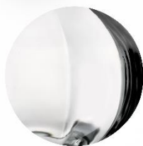
1 x Glass CRI