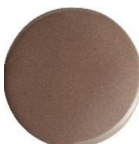
2 x Ceramic MOK