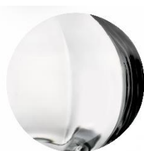
1 x Glass CRI