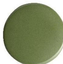
1 x Ceramic VSA