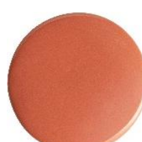
1 x Ceramic APO