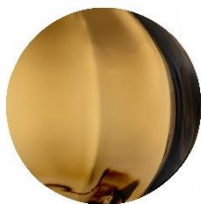
1 x Glass BRO