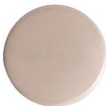
1 x Ceramic GRS