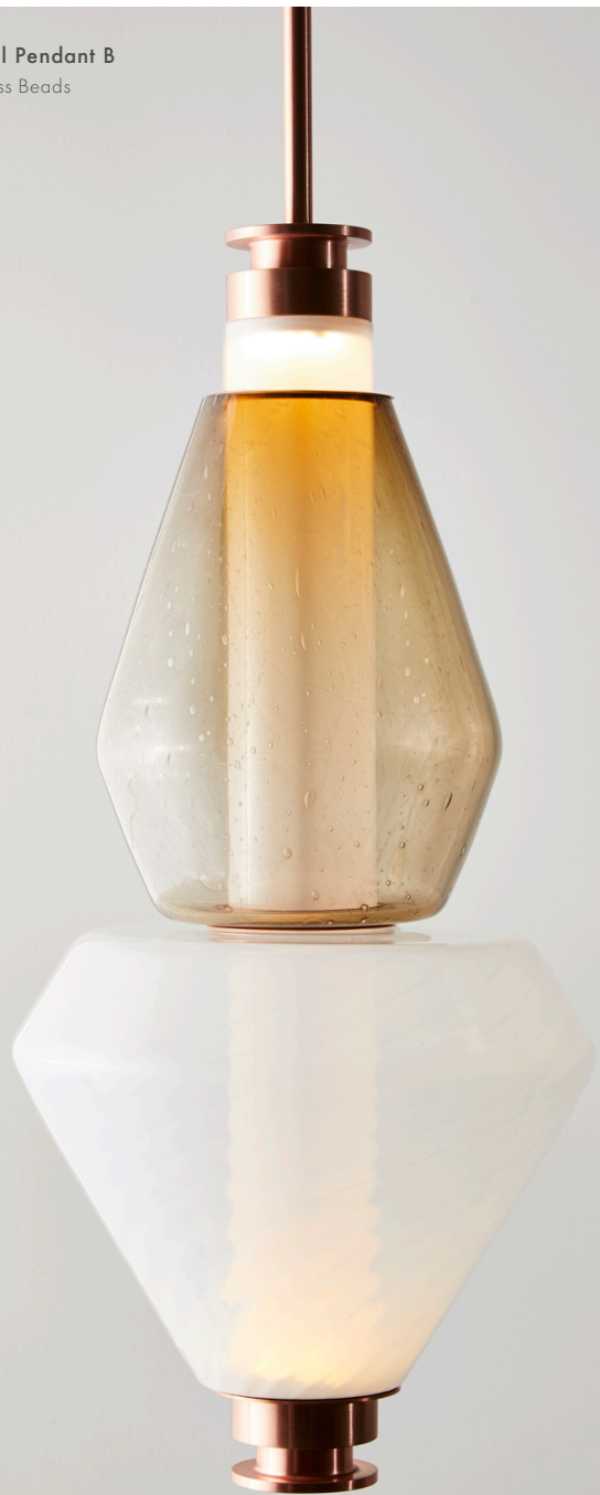
LUNA Kaleido Small Pendant B With Orion & Aras Glass Beads