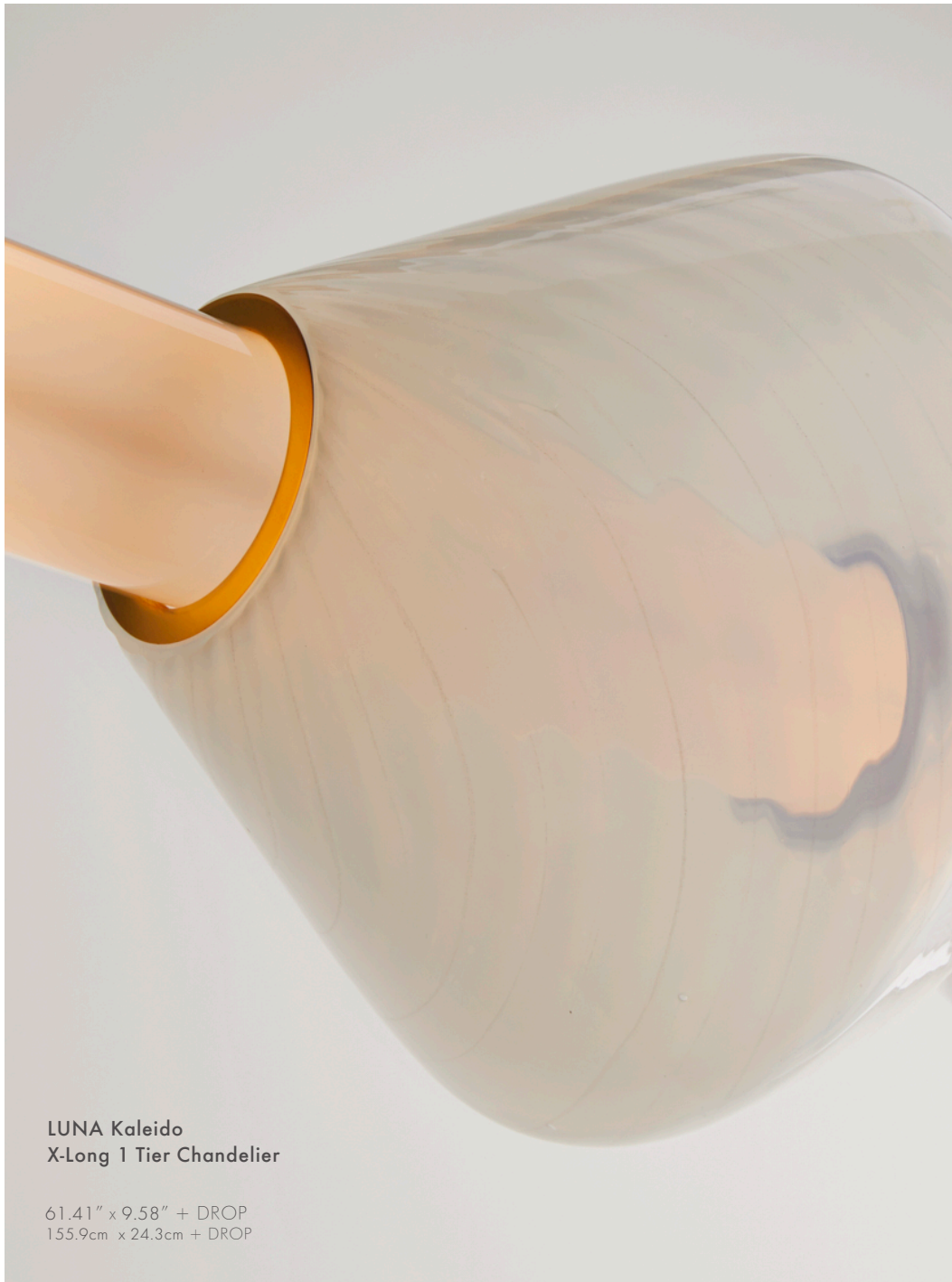
LUNA Kaleido X-Long 1 Tier Chandelier

61.41" x 9.58" + DROP 155.9cm x 24.3cm + DROP