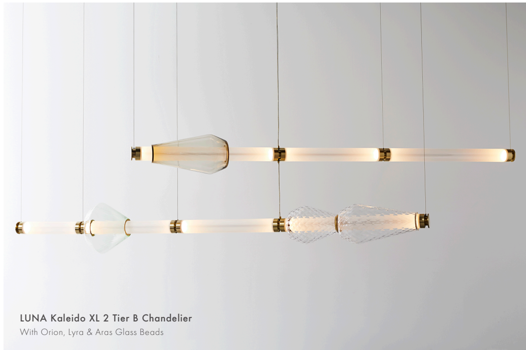
LUNA Kaleido XL 2 Tier B Chandelier With Orion, Lyra & Aras Glass Beads