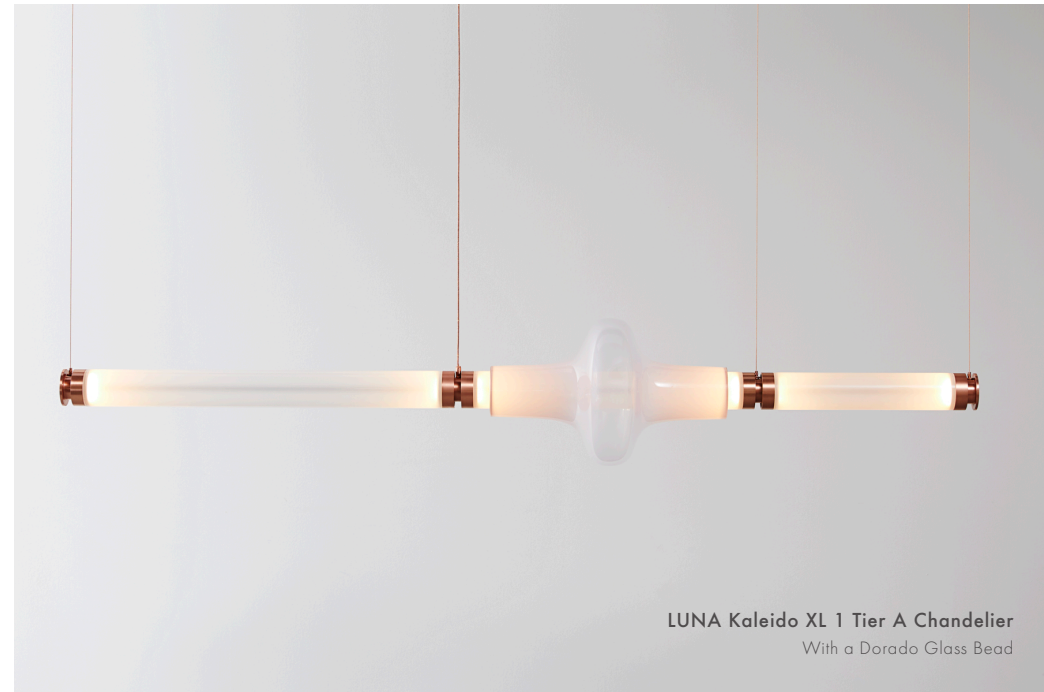
LUNA Kaleido XL 1 Tier A Chandelier With a Dorado Glass Bead

61.41" x 9.58" + DROP 155.9cm x 24.3cm + DROP