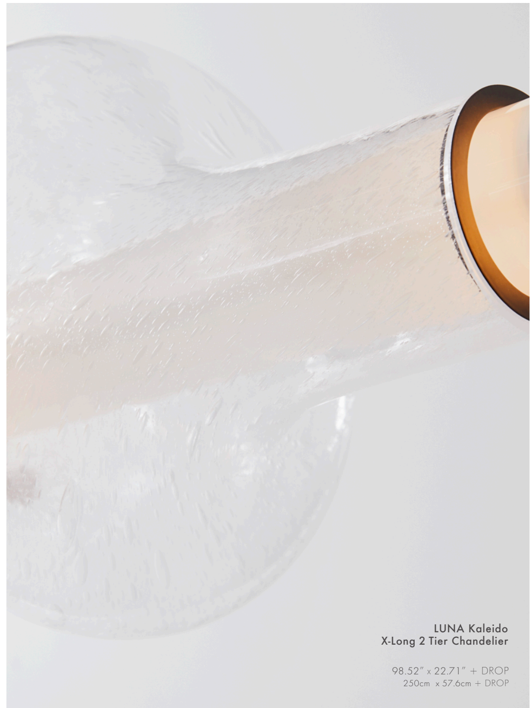
LUNA Kaleido X-Long 2 Tier Chandelier

98.52" x 22.71" + DROP 250cm x 57.6cm + DROP