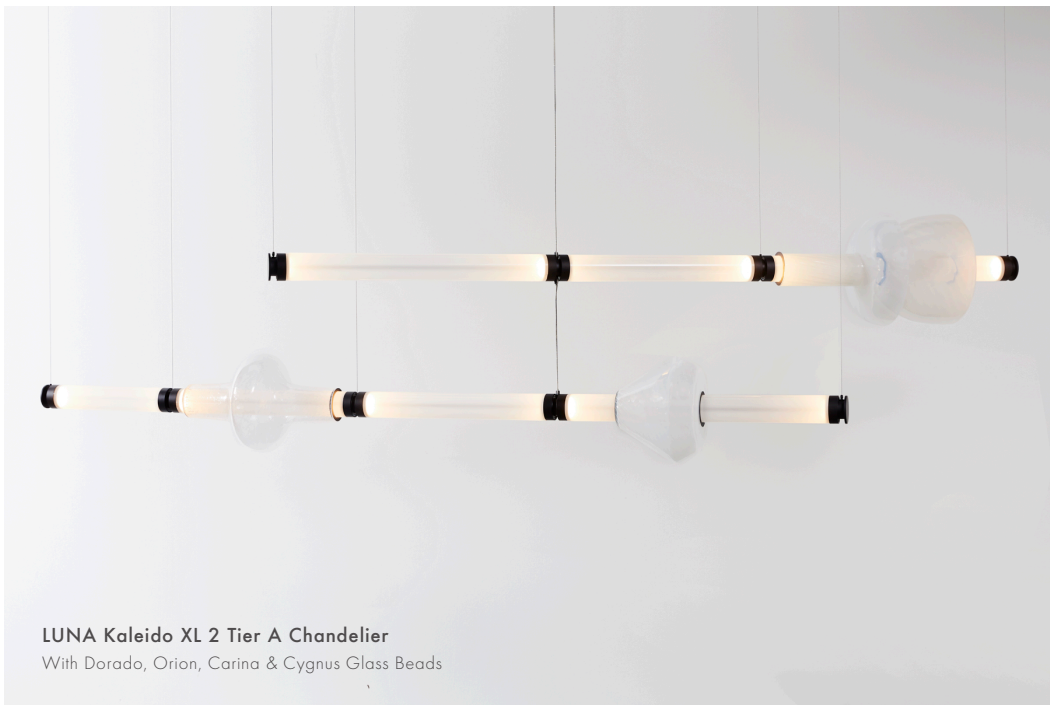
LUNA Kaleido XL 2 Tier A Chandelier With Dorado, Orion, Carina & Cygnus Glass Beads