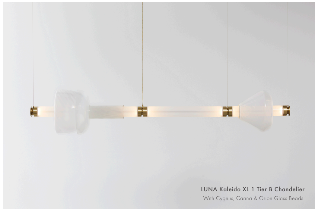
LUNA Kaleido XL 1 Tier B Chandelier With Cygnus, Carina & Orion Glass Beads