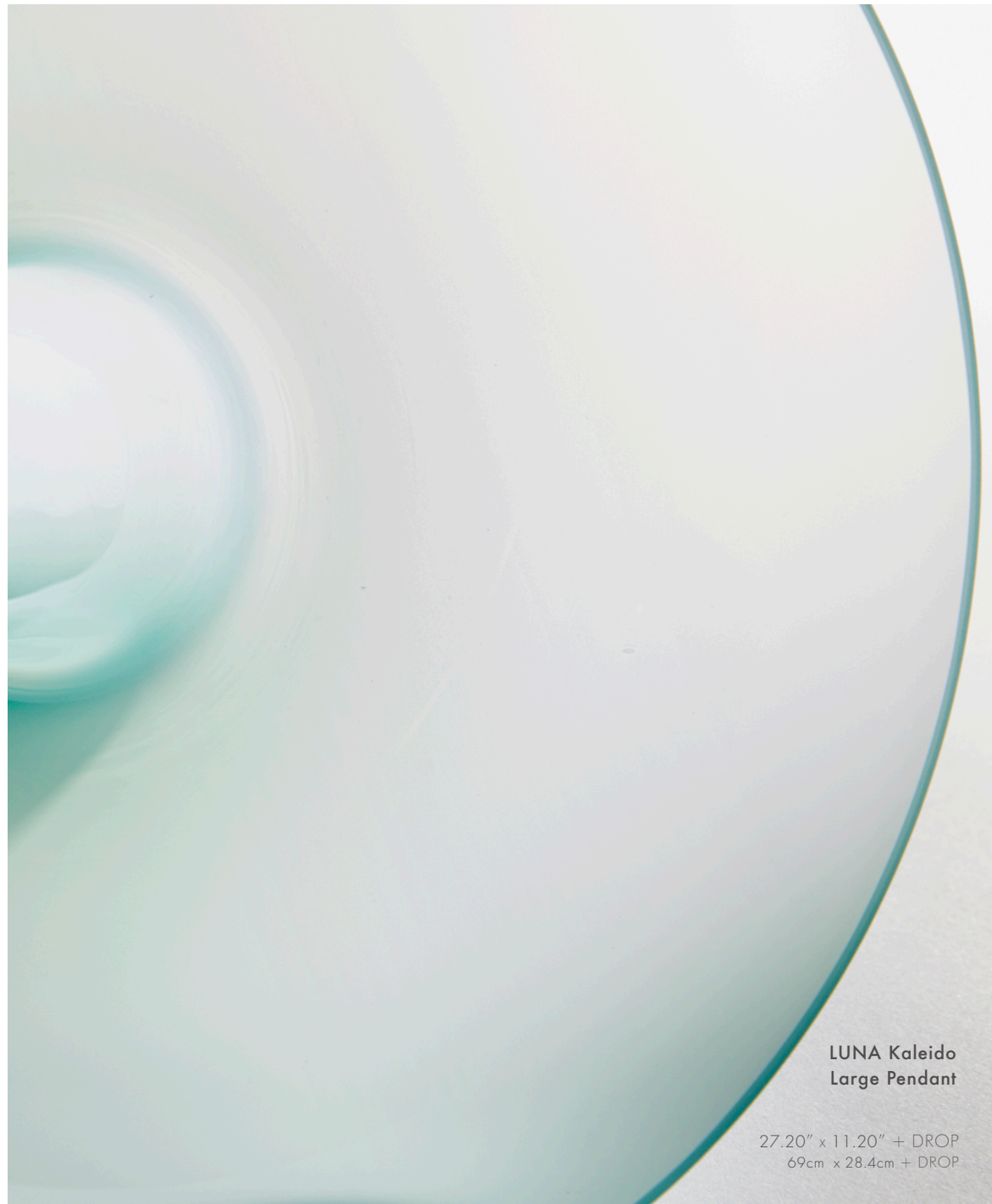
LUNA Kaleido Large Pendant

27.20" x 11.20" + DROP 69cm x 28.4cm + DROP