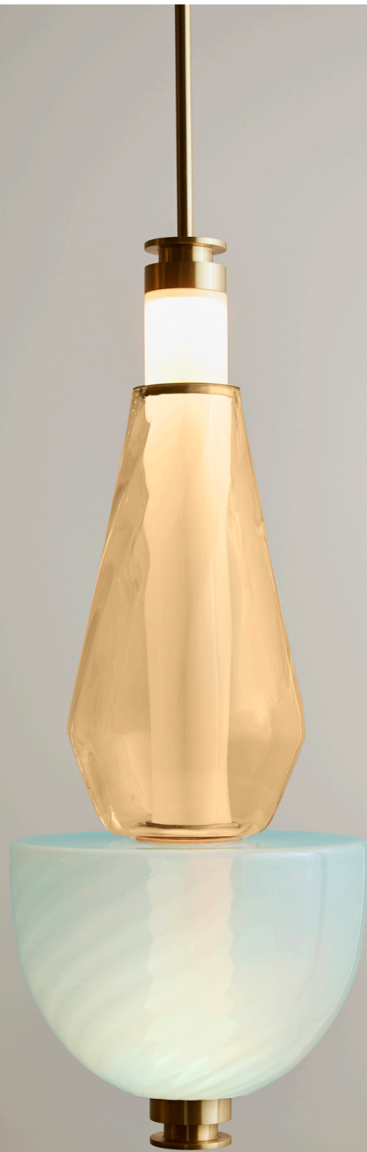
LUNA Kaleido Large Pendant With Cygnus & Lyra Glass Beads