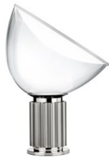
F6604004 Anodized Silver